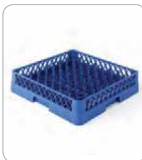
5300112 C-3 Plate basket 500x500mm h:100mm RRP 22€