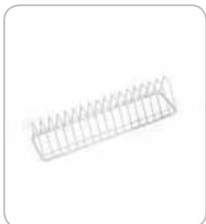
2305488 Saucer carrier 350x95mm RRP 7€