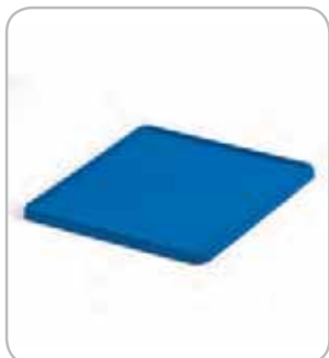
5300152 C-13 Rack cover 500x500mm blind RRP 18€