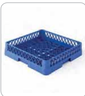
5300105 C-1 Open basket 500x500mm h:100mm RRP 22€