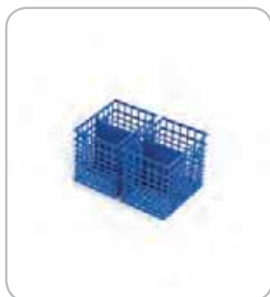
2302617 Small cutlery basket - double RRP 7€