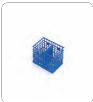
2302615 Small cutlery basket RRP 3€