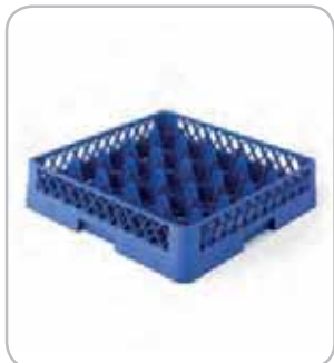
5300159 C-6 Basket 25 compt. Ø90 h:100mm RRP 31€