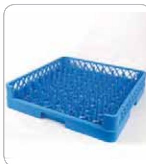
5300120 C-30 Tray basket 500x500mm h:100mm RRP 30€