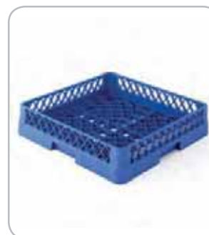
5300130 C-2 Cutlery basket 500x500mm h:100mm RRP 22€