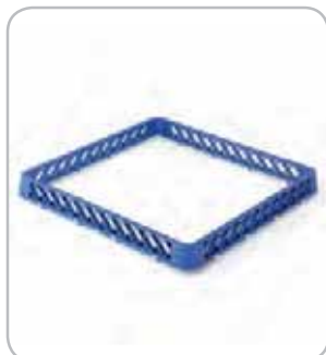
5300200 C-A Open extender h:45mm RRP 9€