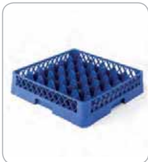
5300184 C-7 Basket 36 compt. Ø75 h:100mm RRP 32€