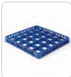
5300215 C-D Extender basket 16compt. h:45mm RRP 10€