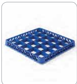
5300205 C-B Extender basket 25compt. h:45mm RRP 12€