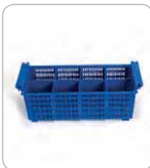
5300125 C-1371 Small cutlery basket 430x210x150mm RRP 14€