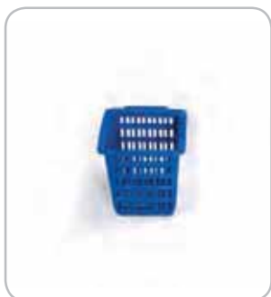
5300135 C-1370 Cutlery cylinder 105x105x125mm RRP 5€