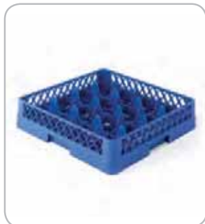
5300174 C-8 Basket 16 compt. Ø113 h:100mm RRP 30€