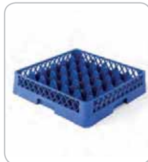
5300194 C-9 Basket 49 compt. Ø64 h:100mm RRP 37€